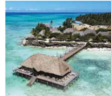
REEF & BEACH RESORT **** Beach Resorts Zanzibar | Jambiani

The island of Zanzibar is considered one of the jewels of the Indian Ocean. Visit historic Stone Town, sunbathe on one of the island's beaches or use the island as a base for a Safari to Tanzania's spectacular National Parks. We are convinced that Zanzibar is the ideal place for your holidays.