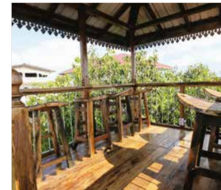
SHABA BOUTIQUE HOTEL **** Beach Resorts Zanzibar | Stone Town