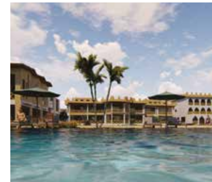
BOUTIQUE RESORT ZANZIBAR ***** Beach Resorts Zanzibar | Uroa