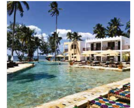
ZANZIBAR BAY RESORT **** Beach Resorts Zanzibar | Marumbi