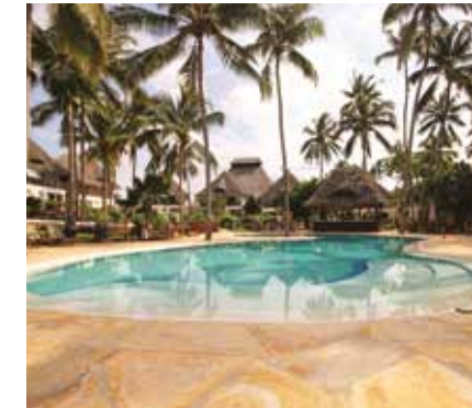
PARADISE BEACH RESORT **** Beach Resorts Zanzibar | Marumbi