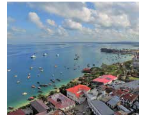
HOUSE OF SPICES *** Beach Resorts Zanzibar | Stone Town