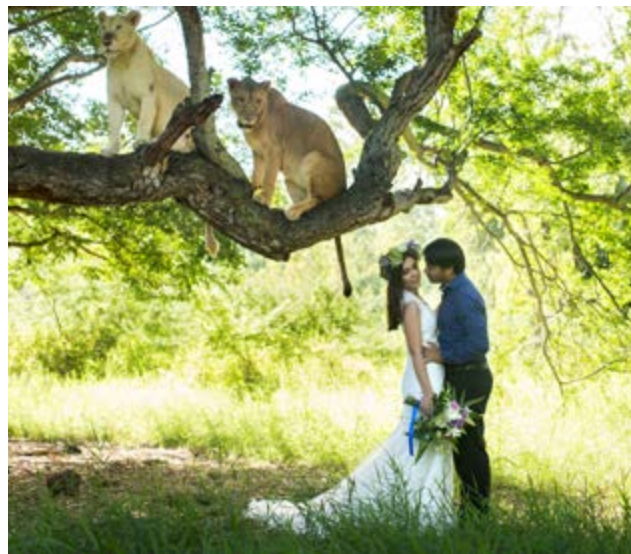
This picture is manipulated. Safety first!

Please inform us of your wishes and preferences and we will prepare your perfect wedding dinner